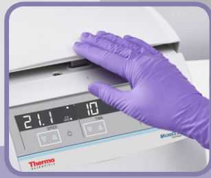
Fast one-click centrifuge lid closure